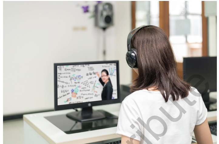
Teachers can use the ever-growing varieties of technology to teach online courses.

The previous section of this chapter provided information regarding jobs, salaries, and expectations for being part of the teaching profession. This section will help clarify the purpose of teacher education