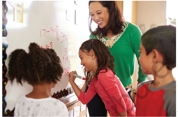
Teachers enjoy seeing their students be successful.

Can you think of a teacher who made a difference in your life? It may be one who really cared about you, persuaded you to apply for college, challenged you to learn, or helped you develop self-esteem.