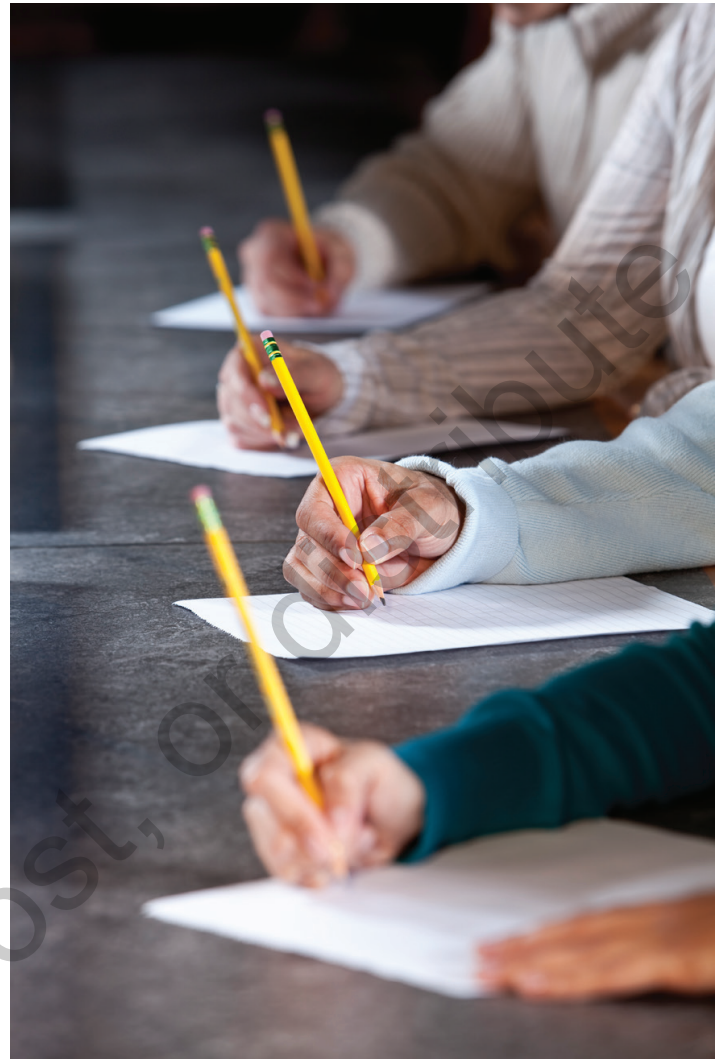
Teachers must demonstrate their knowledge of basic skills and their readiness to teach. Standardized tests provide states with evidence of a teacher's qualifications.

Content Tests. Content tests assess candidates' knowledge of the subject or subjects they will be teaching or the field in which they will be working (e.g., ESL, algebra, or special education). These tests generally assess the knowledge outlined in the state and professional standards for the field, which is another reason to be familiar with the standards. You should develop the knowledge bases for your field in the courses you have taken in the sciences, humanities, arts, psychology, and social sciences. Secondary and middle-level teacher candidates often major in the academic discipline they plan to teach. Some states require elementary teacher candidates to major or have a concentration in one or more academic