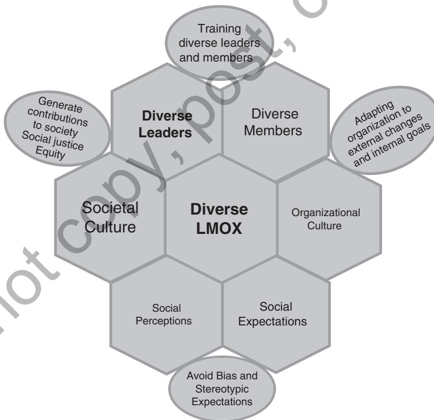
Figure 2.2 Diverse Leader-Member-Organizational Exchange (DLMOX) Paradigm

Diversity Leadership is a result of this exchange between diverse leaders and members within diverse organizational and societal contexts (see Figure 2.1 for Goals of Diversity Leadership). Hence, we modify Hickman's framework to a Diverse Leader-Member-Organizational Exchange Paradigm (DLMOX) to highlight the diverse composition of leaders and members and define the organizational and external environment as both diverse and global (see Figure 2.2). The environment of new era organizations is inclusive of the social identities and lived experiences of diverse leaders and members, the perceptions and social expectations which shape the leader-member exchange, which in turn, influence how an organization implements its mission and adapts its structure to external change. This diverse organizational framework goes from an individual/dyadic perspective to a group/social perspective, from an organizational to societal and ecological perspective, and from a situational to systemic leadership perspective. It will serve as a framework for the book and will be discussed further in Chapter 6.