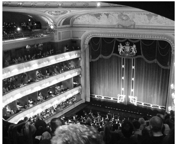
Modes of listening are shaped by a variety of contextual factors.