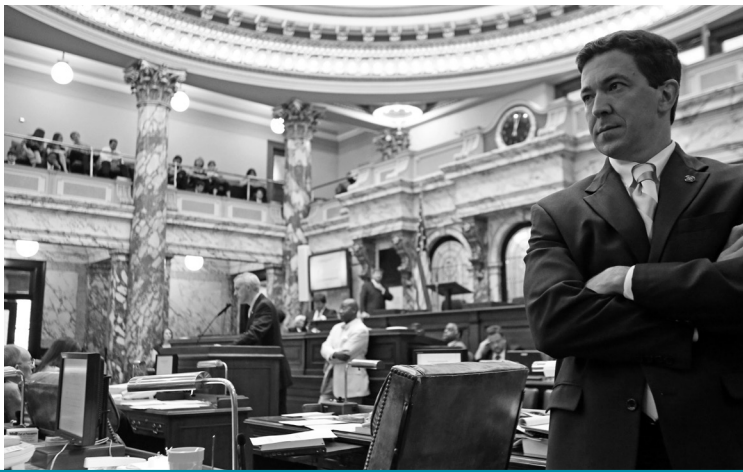
Refusing to engage with someone based on different political perspectives is an act of privilege.

Julia Eklund Koza (2008) makes a similar argument regarding the kinds of racial privilege embedded in vocal auditions for