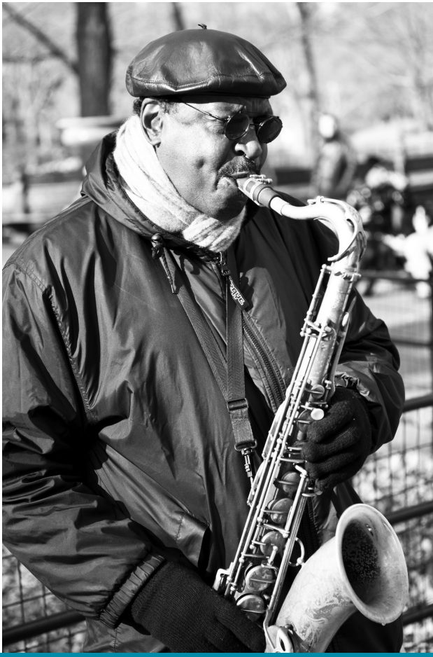
While hearing is a passive act, listening requires our active energy and focus.

In general, hearing is a physiological experience in which sound waves vibrate our eardrums. We usually ignore these sounds or take them for granted. We therefore take hearing to be a passive act, contrasted with the more active practice of listening . In this way, listening is a practice that requires our active attention and focus.