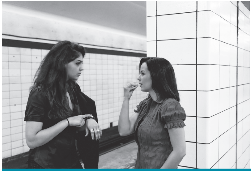
Listening is not limited to our ears.

In this chapter, we consider the complexity of listening as not simply a skill but a fully embodied way of being in the world. In doing so, we address the ways we might practice and develop our capacities as compassionate critical listeners. We begin with a definition of listening as a stance or way of engaging others that is shaped by context, individual experience, and cultural expectations. Next, we describe ethical listening in terms of dialogic engagement. Then, we illustrate how listening is a practice that both shapes and is shaped by culture. Finally, we invite you to consider how listening functions as a way for you to learn from others.