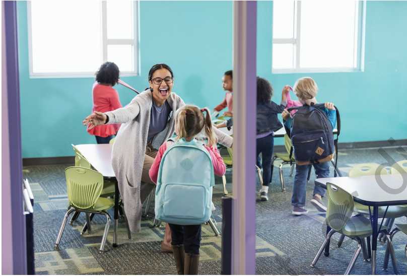
Some classroom climates can be experienced even by a casual observer.

The day-to-day workings of a school influence how you enact your philosophy of teaching. Schools are constantly in flux, depending on student enrolment, collaboration among colleagues, pressures from the local community, and the vision of the school leader. They are especially subject to change as they adapt to the ever-changing health environment resulting from the pandemic. As we will see, some schools closed, others went hybrid, and still others were fully remote. The following workplace descriptions relate to schools that are fully open with students learning face-to-face with each other and their teachers.