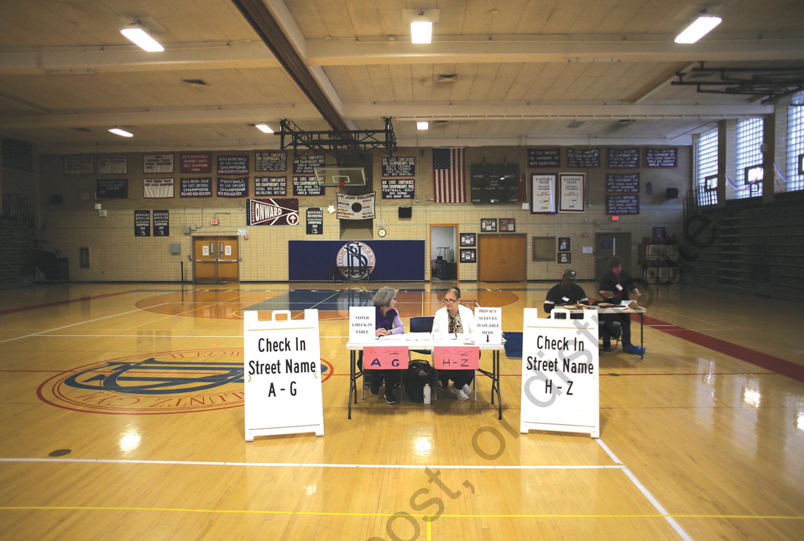
The registration table inside the Brookline High School Schluntz Gymnasium awaits voters on election day.