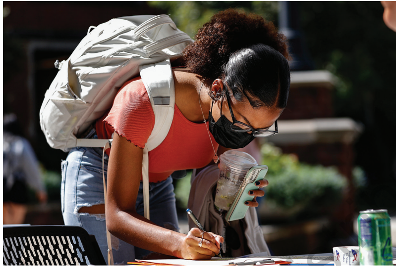
A student at the University of Tennessee, votes in the 2020 presidential election.