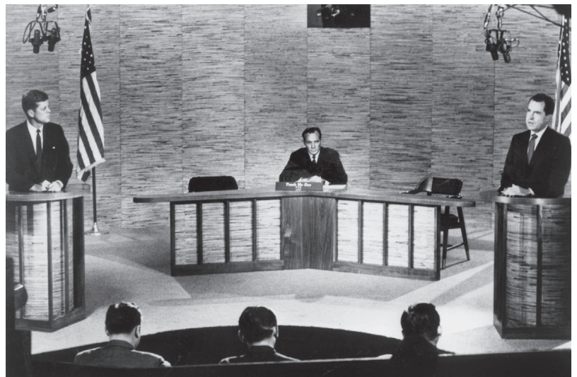
John F. Kennedy and Richard M. Nixon at one of their three presidential debates during the 1960 presidential campaign.

Although revolutionary, TV was not the first communications medium to transform political campaigns. Radio, which by 1932