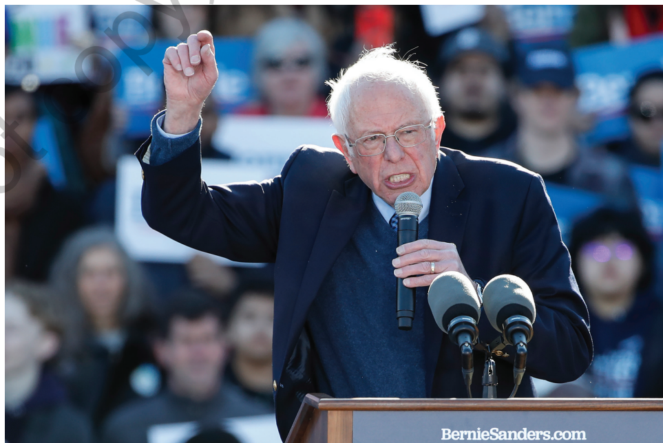
Senator Bernie Sanders, a member of the Socialist Party, campaigns for the Democratic Party's nomination in 2020. He has been a harsh critic of capitalism.