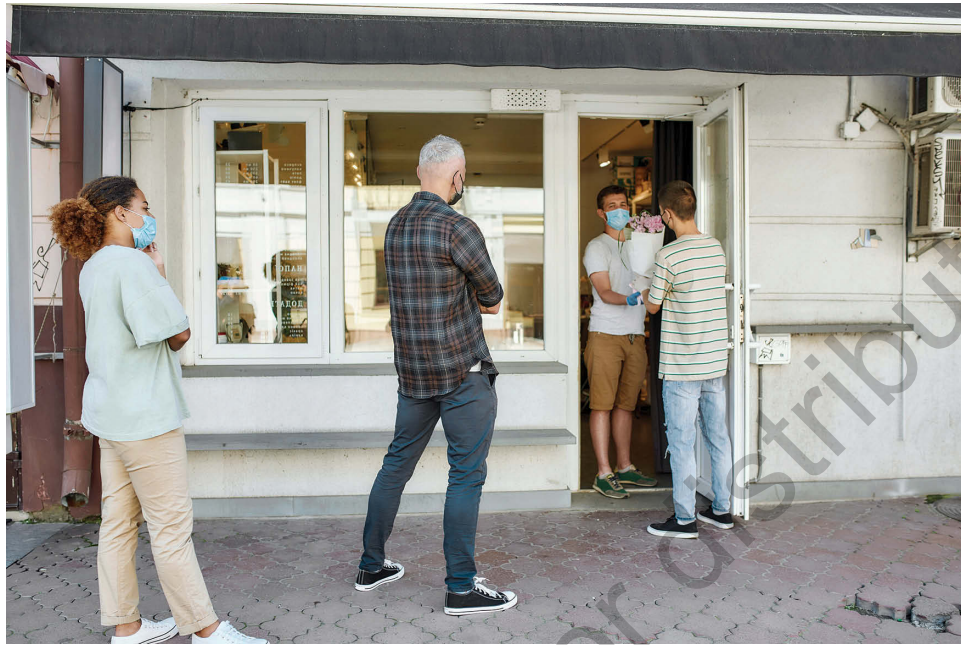
People became increasingly aware of space and distance during the COVID-19 pandemic.