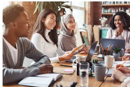
Cultural differences influence the encoding and decoding of messages.

New communication forms—new channels—alter our communication experiences. Technology and social media are game changers. Using them speeds up communication. Instead of valuing sequential understanding and careful logic, we seek immediate gratification and emotional involvement with people near and distant, close to home and around the world. As our real and virtual communication repertoires expand, we exist simultaneously both in the physical world and online.