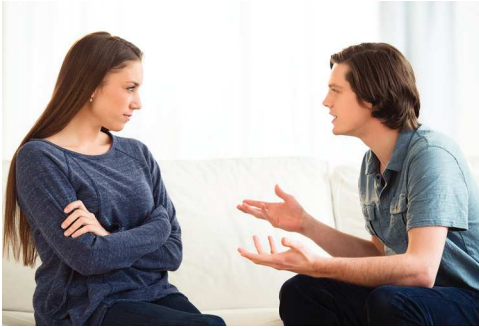
Gestures convey messages.