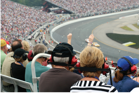
NASCAR events illustrate the core sociological idea that each of us is shaped by others with whom we spend significant time. Fans don't just share a love of auto racing; they also often work in similar types of jobs and have common political views.