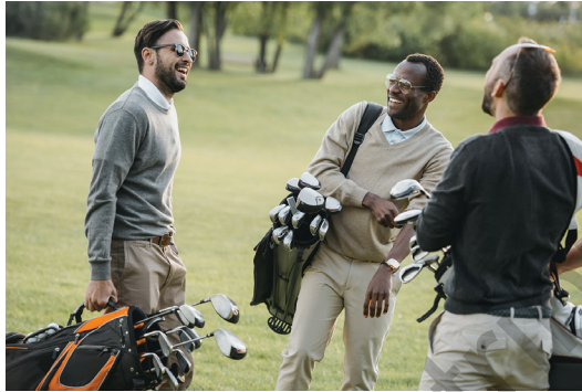
Because golf enables people to be with others who can similarly afford to spend money and time playing this sport, it contributes to their tastes about how to enjoy leisure time.