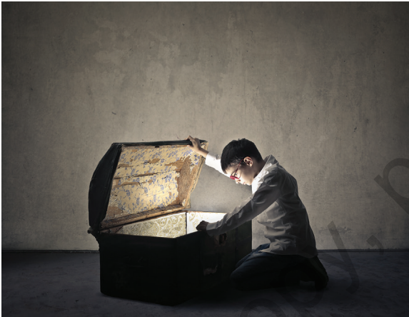
This book shows you how to discover the hidden workings of our society.

Let's consider other groups that may be important to you. For example, it can be sociologically meaningful whether you are a "dog person," a "cat person," or dislike pets altogether. The same goes for people who prefer Instagram versus Snapchat versus don't use social media at all (such people exist!). Even more significant are the differences between those who have served in the military and those who have lived an entirely civilian life, between religious fundamentalists and atheists, and between pro-choice and pro-life abortion activists. A person must do substantial research, often lasting several years, in order to earn a Ph.D. and become a sociologist. However, you need no prior training to begin thinking like one. All that's required is an interest in exploring how data about human behavior can expand your current understanding about the workings of society. I recall having this insight when I took my first sociology course in college. During the ensuing thirty plus years that I've studied and taught sociology, I've learned again and again how to think in refreshing ways I didn't know were possible. One of my greatest joys has been seeing students come to this same realization.